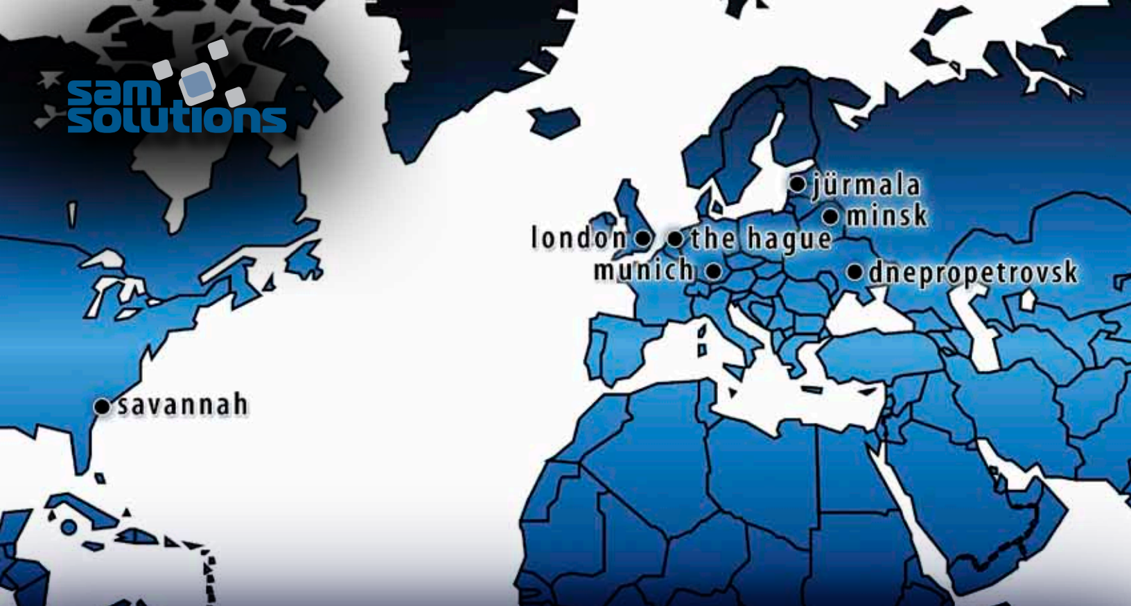
SaM Solutions international office locations